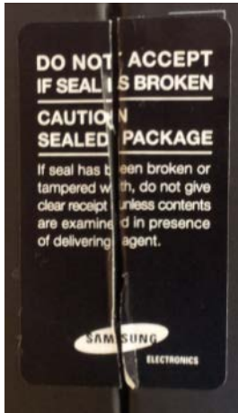
Figure 2 - Security Seal (Black)