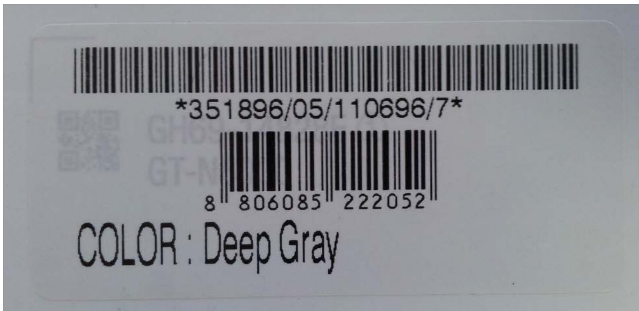
Figure 1 - Tracking Label

The tracking label should look similar to Figure 1 - Tracking Label, while the two tamper labels should appear similar to Figure 2 - Security Seal (Black) or Figure 3 - Security Seal (White).